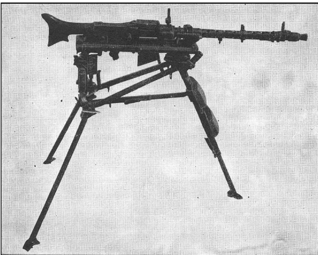
M.G. 34, caliber 7.92 mm, on tripod mount as heavy machine gun.